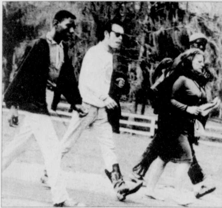
Viola Luizzo of Detroit (right) completes the march, but is bushwhacked that night while driving through Lowndes County.