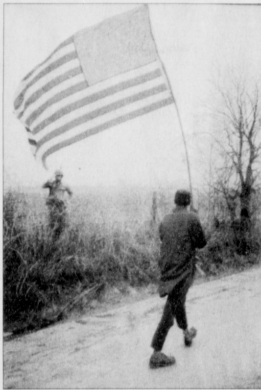
A soldier salutes (left) as marchers stretch out from Selma into Lowndes County by day (above) and bed down in muddy fields by night (bottom).