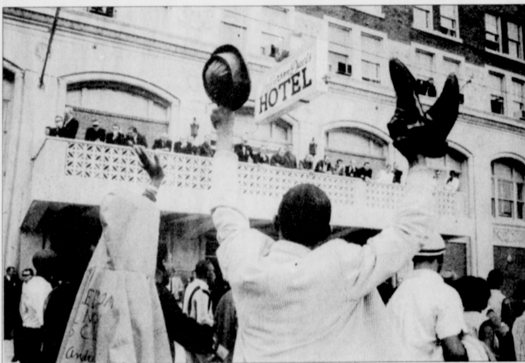
Marchers entering Montgomery on the fifth day wave to observers.

PEOPLE MARCHED FOR IT. RODE THE BUS FOR IT. WENT TO JAIL FOR IT.