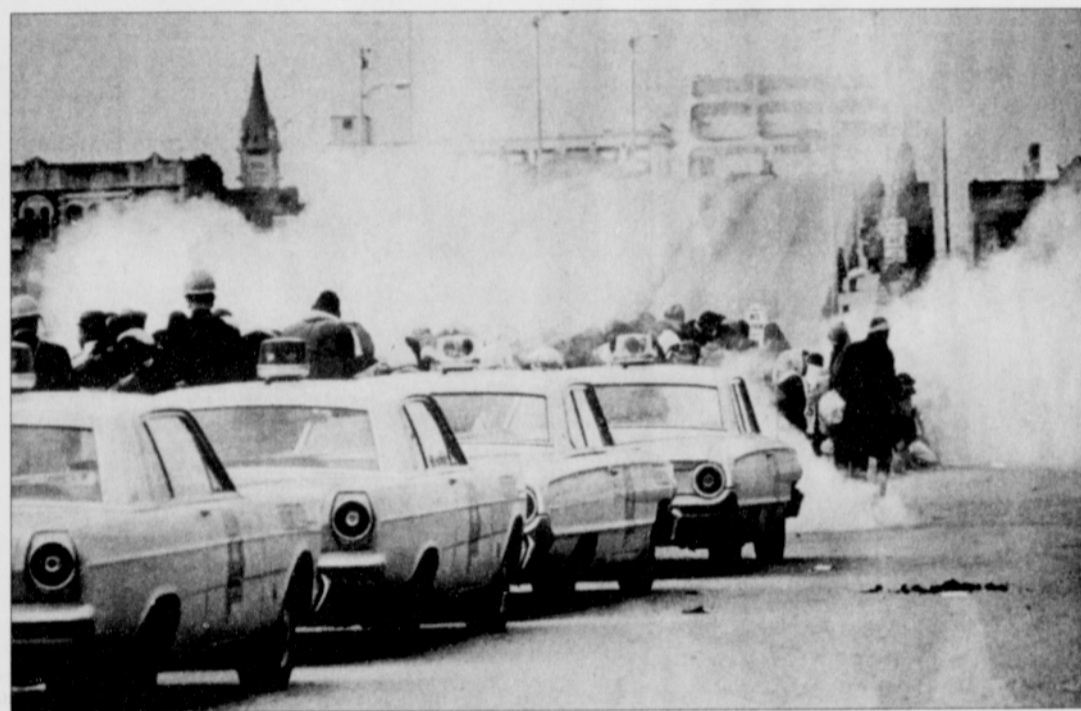
On "Bloody Sunday," March 7, 1965, Alabama State Troopers and a sheriff's posse in clouds of tear gas trample the first attempted voting rights march out of Selma.