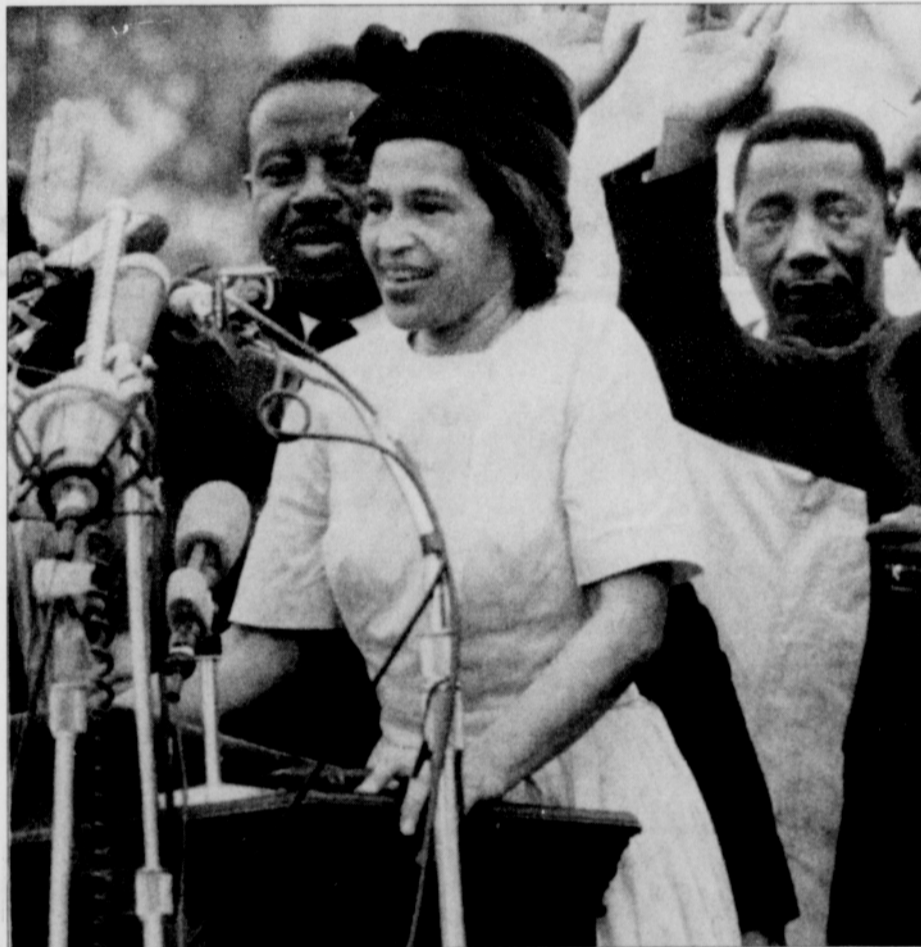
Rosa Parks speaks to the crowd before King's address on the triumphs and pitfalls of the modern civil-rights movement.

Our lives begin to end the day we become silent about things that matter.