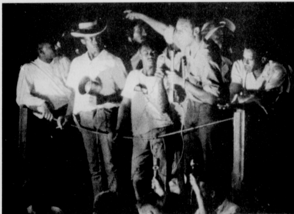
The new Student Nonviolent Coordinating Committee chairman Stokely Carmichael proclaims a "black power" slogan at the rally in Greenwood on June 16, six weeks after his independent-voting effort in Londes County was either scorned or ignored.