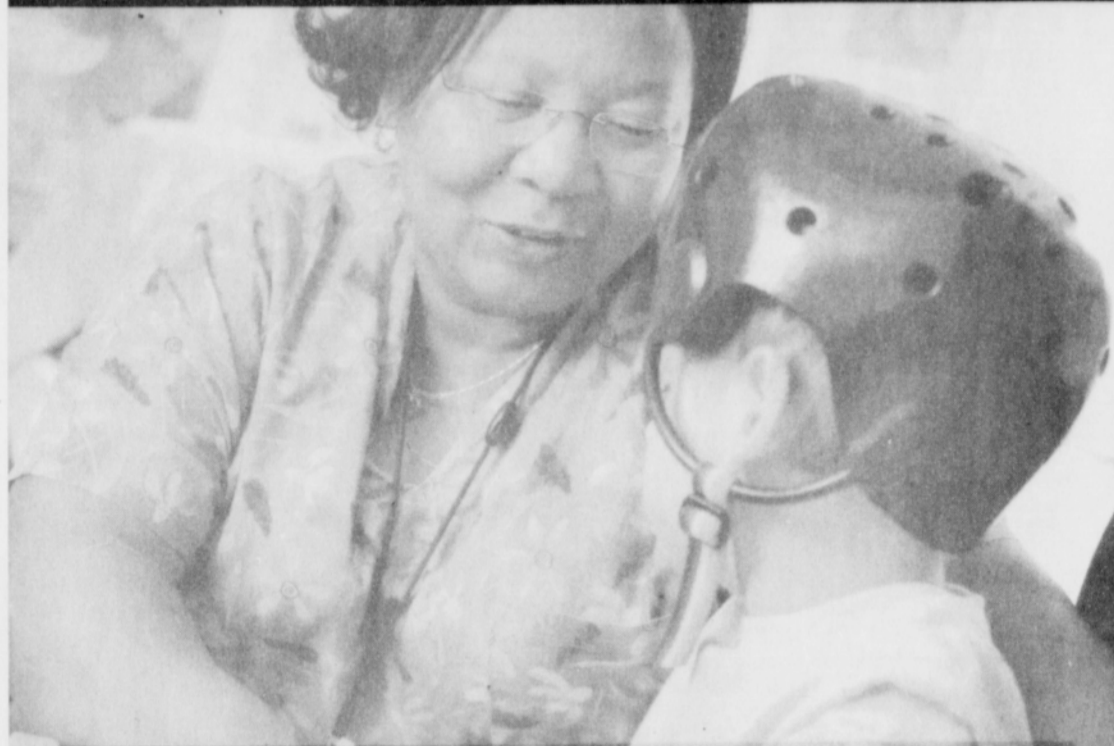
Legacy Emanuel Hospital is a major employer in Northeast Portland and a cornerstone for community health and healing.

We believe that everyone should enjoy the best healthcare available.