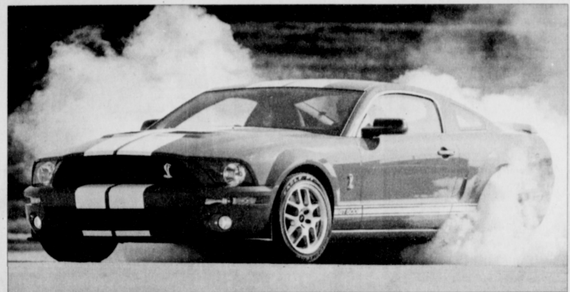
Specifications: 5.4-Liter, 500-hp@480 lb-ft. torque, V8, 32-Valve DOHC SMPI Engine; 6-speed manual transmission; 0-60 mph: 4.5 seconds; 15-City 21-Highway MPG; $43,765. MSRP

Aficionados know they are getting more than a retro-styled sports