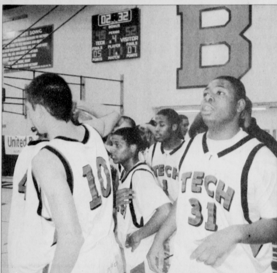
Benson players find themselves down by seven points against a talented Jesuit team with just over two-and-a-half minutes to play.