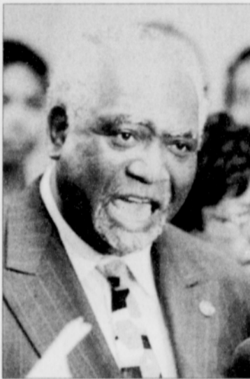
U.S. Rep. Danny Davis

"I'm not one of these people who cry racism," Davis told The Associated Press. "I'm a person