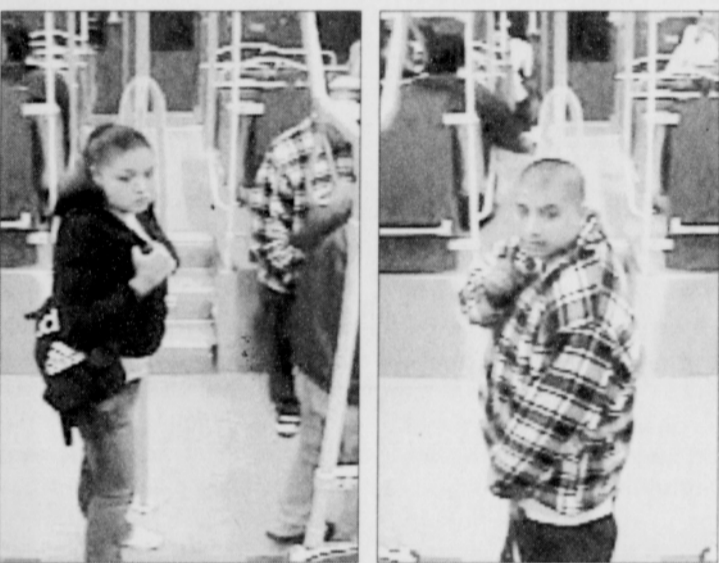
Police released surveillance video to help identify two suspects accused of being associated with an assault of a 71-year-old man at a Max station in Gresham.

A report released earlier this year by the Illinois Department of Transportation found that police throughout Illinois stop minority drivers for traffic violations in larger percentages than driver population numbers would suggest, and minorities were much more likely to be searched than whites.