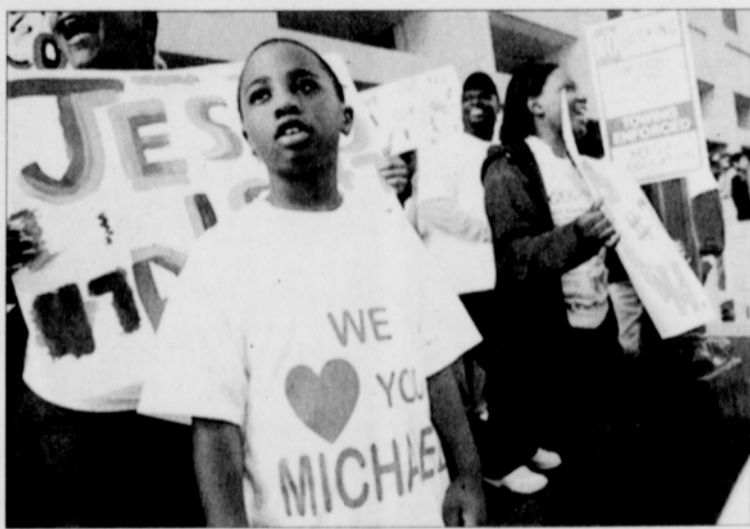
Supporters of Michael Vick hold signs and sing as they line up across the street from Federal Court prior to the sentencing of the Atlanta Falcons quarterback on dogfighting charges.

Texas involving the NFL Network. "As I said earlier when we suspended him indefinitely, we would evaluate that when the legal process was closed."