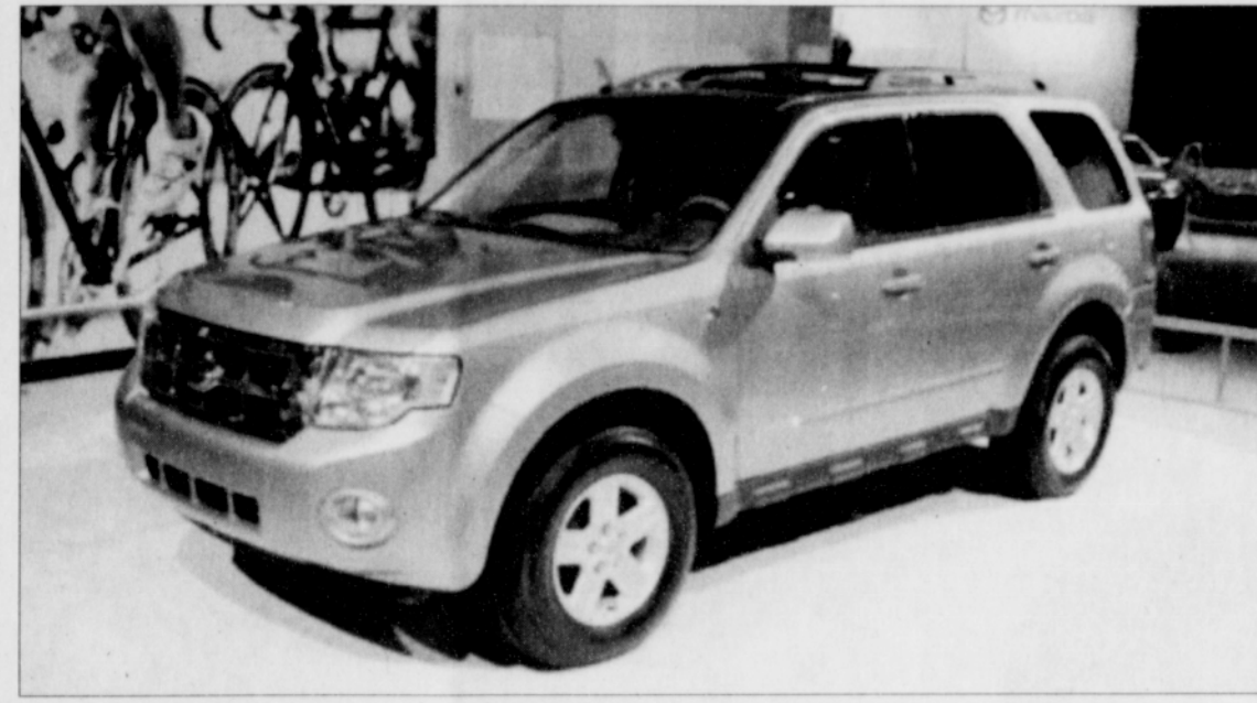
Specifications: 2.3-Liter 133-hp @ 124 lb-ft. torque 4-Cylinder Atkinson-Cycle Gas Engine, 70kilowatts Electric Drive Motor; 330V Hybrid Battery; ECVT Automatic Transmission; 34-City 30-Highway MPG; Green Rating 77; $29,825. MSRP

Few drivers will notice any sigcally switches between pure elec- nificant difference between the Hybrid and a conventional Escape, except when the Hybrid shuts itself off at stop lights or glides quietly through a parking lot on electric power. Indeed, the Hybrid is a bit quieter, probably smoother, in all V-6 engine. In less demanding situ- circumstances. In order to minimize ations, the Escape Hybrid can run the power lost as it transfers to the entirely revised restraint system drive wheels, Ford equips the Esup to 25 mph), its gasoline engine cape Hybrid with a continuously alone or the most efficient combi-variable transmission, which has steering wheel. Standard safety driver and front passenger.