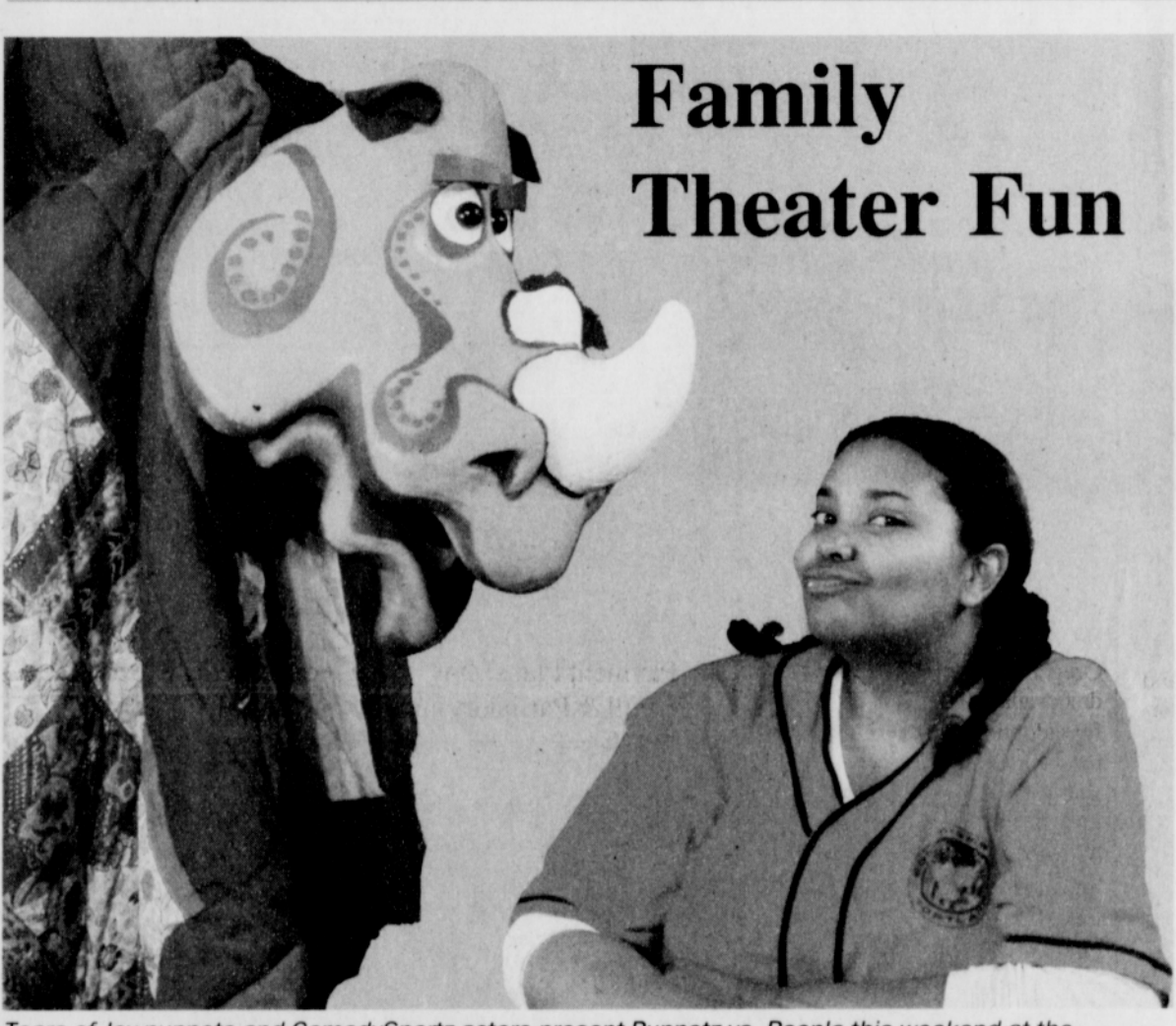
Tears of Joy puppets and ComedySportz actors present Puppetz vs. People this weekend at the Winningstand Theatre in the Portland Center for the Performing Arts.

The 2008 Ford Escape remains one of the best vehicles in Ford's lineup, and competitive in a crowded field of small sport-utilities, regardless of price. The Escape Hybrid is a different beast entirely from gasoline-only