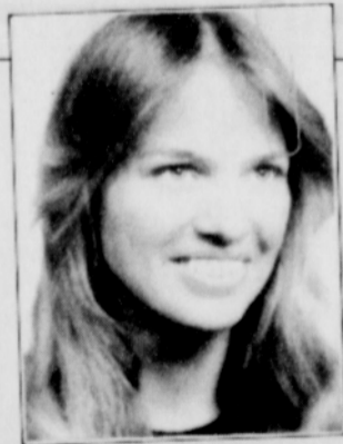
CASE NUMBER: 79-19210

There is a cash reward offered for information reported to the Cold Case Homicide Unit that leads to an arrest in this case.