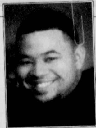
CASE NUMBER: CS 03-45

The Portland Police Bureau and the families for whom have suffered such horrible losses ask for your help in finding justice for these victims.