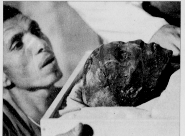
An archaeological worker looks across at the face of the linen-wrapped mummy of King Tut as he is removed from his stone sarcophagus in his underground tomb.

Hawass said scientists began restoring the badly damaged