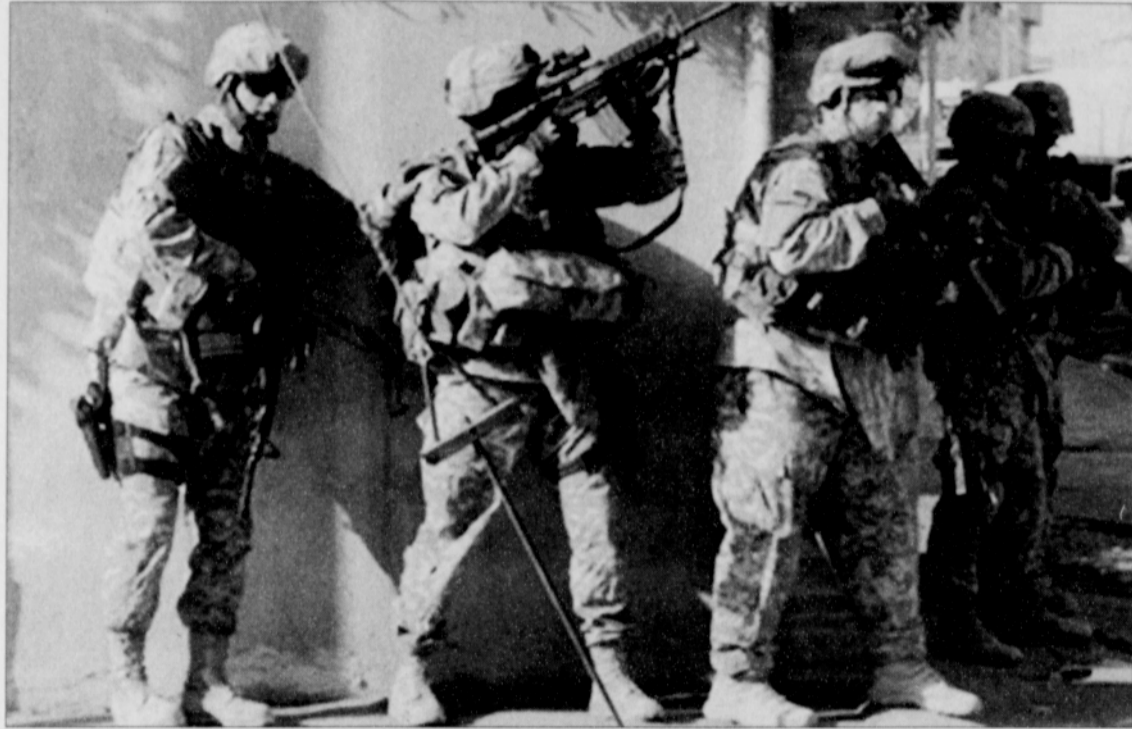
U.S. Army soldiers prepare to search an automotive yard in Mosul, Iraq on Tuesday.

With nearly two months left in the year, the U.S. toll has already surpassed that of 2004, when 850 troops died — mostly in larger, more conventional battles like the