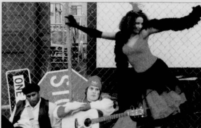
Godspell production hits Interstate Avenue.

Rock Against Diabetes NW -- Saturday, Nov. 10, from noon to 10 p.m., McMenamin's Kennedy School will host the concert to benefit Juvenile Diabetes Research Foundation; $20 donation at the door.