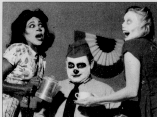
La Carpa del Ausente

Festival of Trees -- Thursday, Nov. 29 from 5:30 to 11 p.m., the 25th-annual Providence Festival of Trees kicks off with an auction and dinner at the Oregon Convention Center. Public shows available Friday, Nov. 30, 10 a.m. to 9 p.m. and on Saturday, Dec. 1, from 10 a.m. to 6 p.m. Visit providence.org/festivaloftrees for tickets.