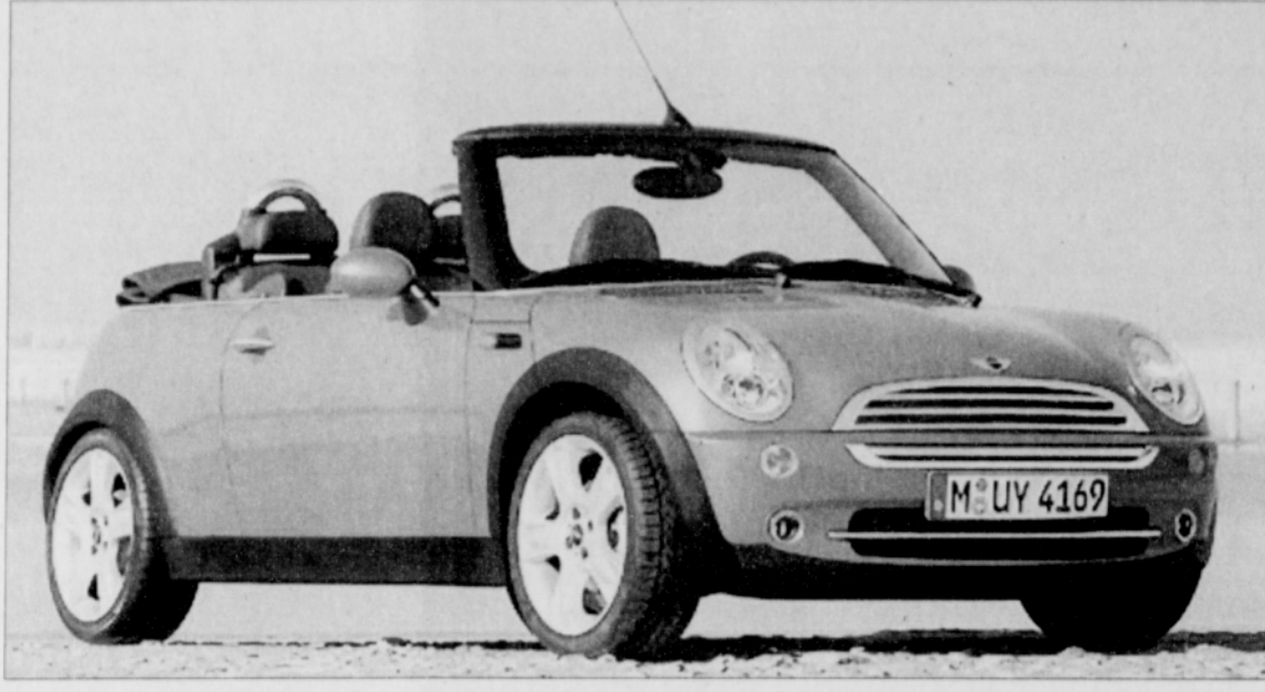
Specifications: 1.6-Liter, 16-Valve, inline 4-Cylinder Engine; 5-Speed manual transmission; 26-City 35-Highway MPG; $ 27,400. MSRP

A five-speed manual transmission is standard for the base model, while the Cooper S gets a six-speed Our compliments on the genius manual. Optional for the base model design of this soft-top; being such is a continuously variable automatic