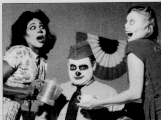
La Carpa del Ausente

12 Angry People -- Wednesday, Oct. 31 through Saturday, Nov. 3, Wilson High School presents the intriguing tale of a dissenting juror in a murder trial that slowly convinces other jurors to look much closer at the evidence. Performances begin at 7 p.m. with a 2 p.m. matinee on Saturday.