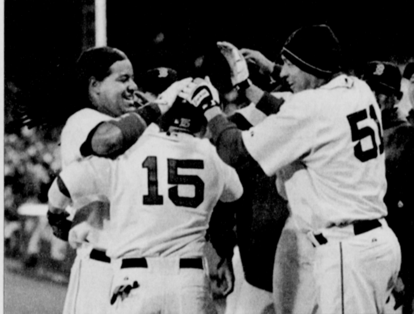
Boston Red Sox's Manny Ramirez (left) and Julian Tavarez congratulate Dustin Pedroia (15) after his two-run homer in Game 7 of the American League Championship against the Cleveland Indians.

For the wild-card Rockies, it's their first World Series. For Manny