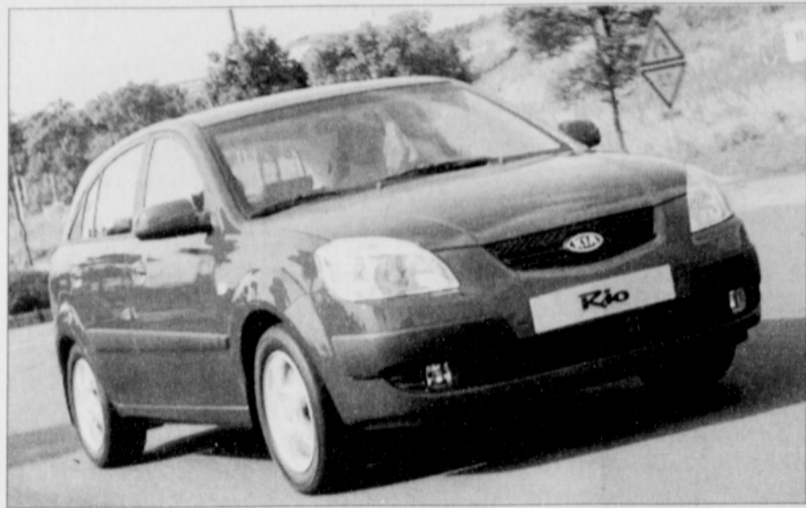
Specifications: 1.6-Liter 16-Valve, 4-Cylinder, 110-hp @ 107 lb-ft torque engine; 4-Speed Automatic transmission; 29-City 38-Highway MPG; $16,260 MSRP

flair to the compact car segment. The front end features a black mesh grille, black air dam insert, and more pronounced hood lines. The side flanks add sporty wheel flares, and the rear end has been reshaped for a cleaner appearance. The hatchback features fog lamps, a rear spoiler, 15-inch alloy wheels and power steering. For 2007, 16-inch alloy wheels are optional. Regardless of which Rio you choose, the car comes with Kia's 10-year/100,000-mile powertrain warranty.