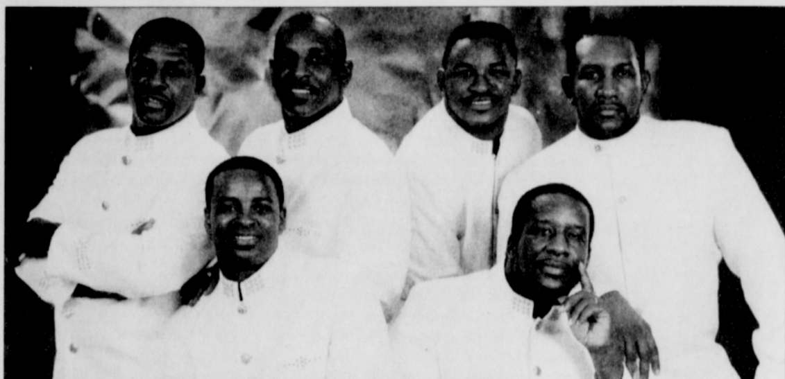
The Bolton Brothers gospel group hails from Hattiesburg, Miss.