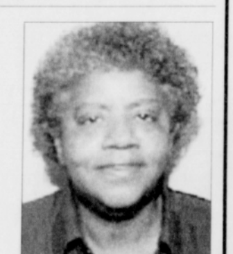
Current Age: 55

Date Missing: June 10, 2006 Missing From: West Columbia, SC