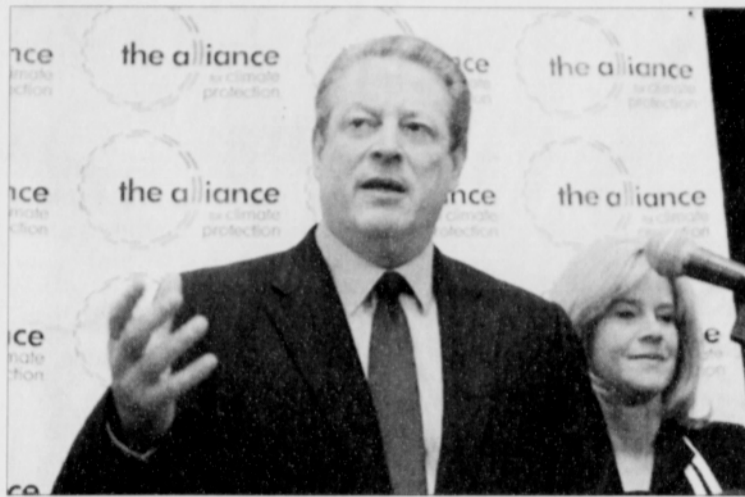
Former Vice President Al Gore speaks at a news conference as his wife Tipper looks on in Palo Alto, Calif. Friday after winning the 2007 Nobel Peace Prize.

"This is just the beginning," Gore said. "Now is the time to elevate global consciousness about the challenges that we face."