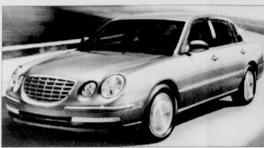
Specifications: 3.8-Liter 24-Valve 264-hp @ 260 lb-ft. torque V-6 Engine; 5-Speed Automatic Transmission; Basic warranty: 5-year/60,000-mile; Powertrain warranty: 10-year/100,000-mile; 19-City 26-Highway MPG; $30,425 MSRP

Under the hood is an all-new 3.8-liter aluminum DOHC V6 engine that delivers 264 horsepower and 260 lb-ft of torque- a 32 percent increase. Kia estimates the 0-60-mph time to be close to 9 seconds.