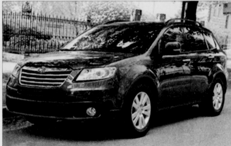
Specifications: 3.6-Liter Boxer 6-Cylinder 256-Hp @ 247 lb-ft. Torque Engine; Symmetrical AWD; 5-Speed Sport-Shift Automatic Transmission; 16-City 21-Highway MPG; $39,678. MSRP

Our test model was the luxuriously appointed Limited which stimulates the driver and passen-