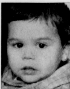
MARTEENCASEY Current Age: 2