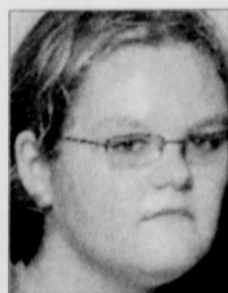
ELLACASEY Current Age: 16