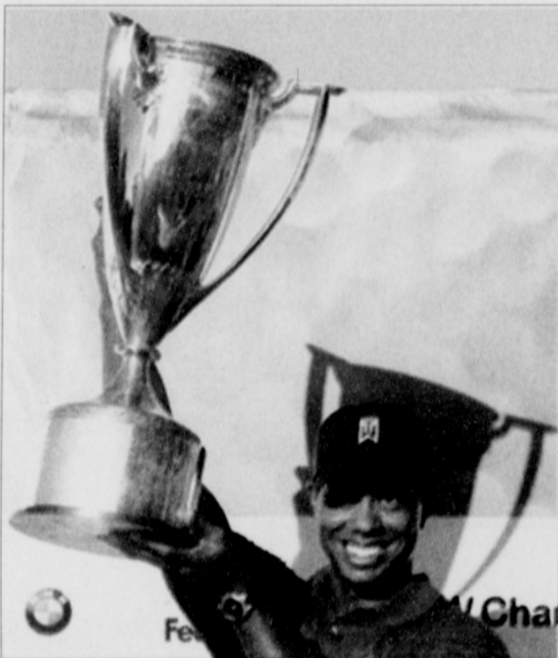
Tiger Woods holds the J.K. Wadley trophy after winning the BMW Championship PGA golf tournament, Sunday in Lemont, Ill.

This 60th victory of the PGA Tour made the 31-year-old Woods the youngest player to hit that milestone.