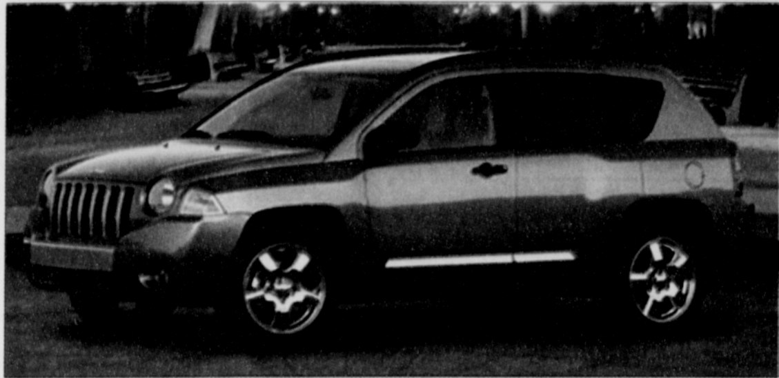
Specifications: 2.4-Liter 4-Cycle 16-Valve 172-hp @ 165 lb-ft. torque Engine; Automatic-CVT2 Transmission; 23-City 26-Highway MPG; $17,175 MSRP

The Jeep Compass Sport offers a Continuously Variable Transaxle,