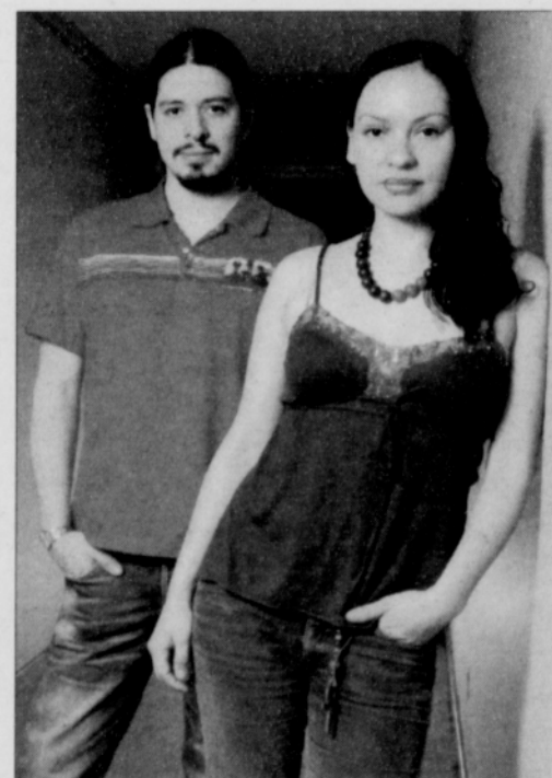
Heavy metal and Latin duo Rodrigo y Gabriela perform Friday, Aug. 31 at the Oregon Zoo.

"Rodrigo y Gabriela" hardly sounds like the name of an Irish metal band - but while Rodrigo (Sanchez) and Gabriela (Quintero) are Mexican and play acoustic guitars, the duo, now based in Dublin, still channels the blazing guitar riffs and arena-rock ambi-