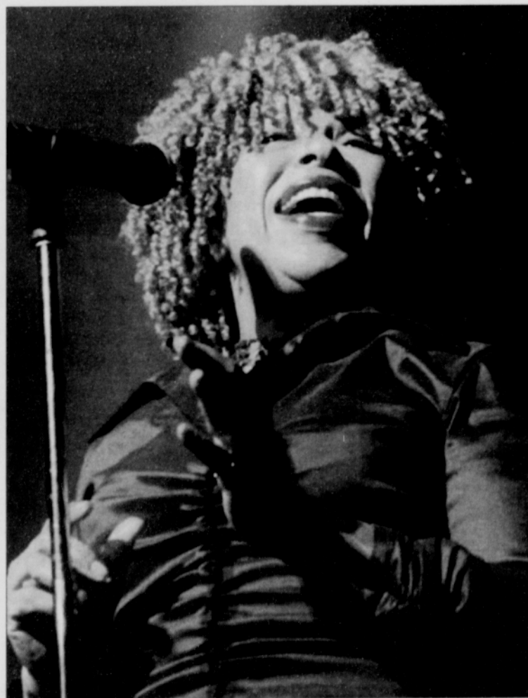
Roberta Flack will delight audiences with her iconic voice at the Chinook Winds Casino Resort in Lincoln City.

Robert Flack is bringing her long time hits like "First Time Ever I Saw Your Face" and "Killing Me Softly" to Chinook Winds Casino Resort in Lincoln City, Friday, Sept. 7 and Saturday, Sept. 8. Tickets are $25 to $40. Show times are 8 p.m. for both nights.