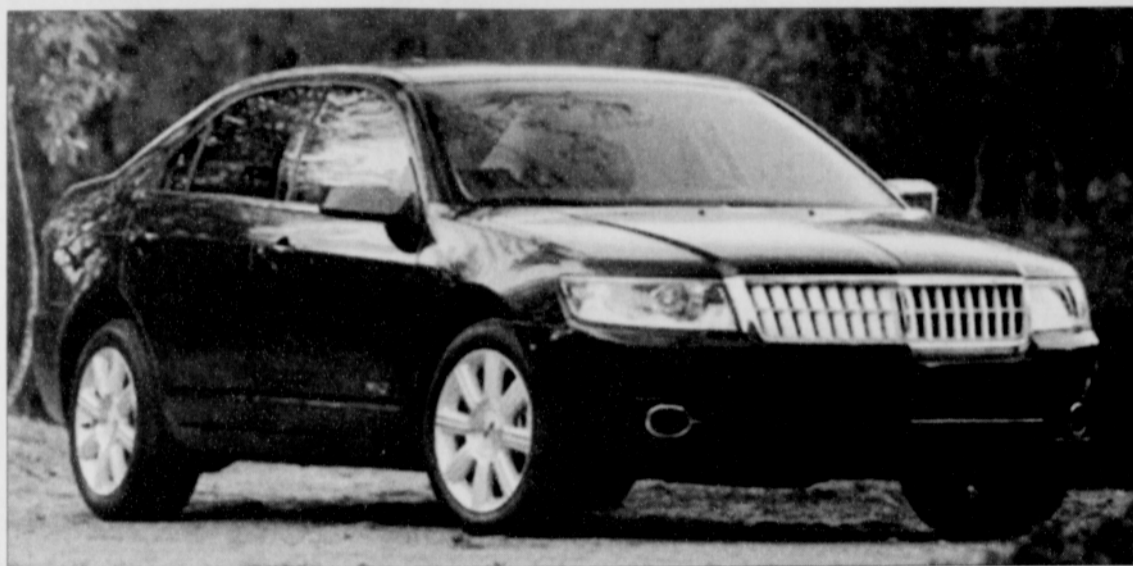
Specifications: 3.5-Liter 263-hp @ 249 lb-ft torque V-6 Engine; 6-Speed Automatic Transmission; 18-City 26-Highway MPG; $ 35,640 MSRP

Then there's the matter of the MKZ's styling, which although unusual, doesn't seem likely to resonate well with the younger custom-