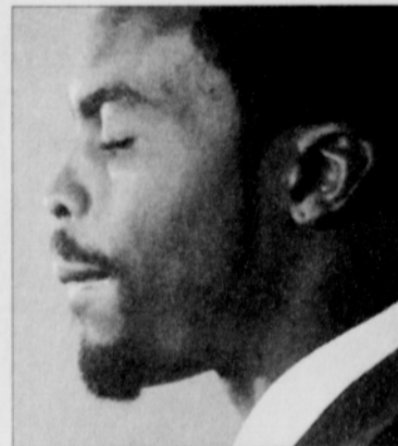
Atlanta Falcons quarterback Michael Vick pauses during a statement to the press Monday after pleading guilty in a dogfighting case.

"I made a mistake in using bad judgment and making bad decisions," he said. "Dogfighting is a terrible thing."