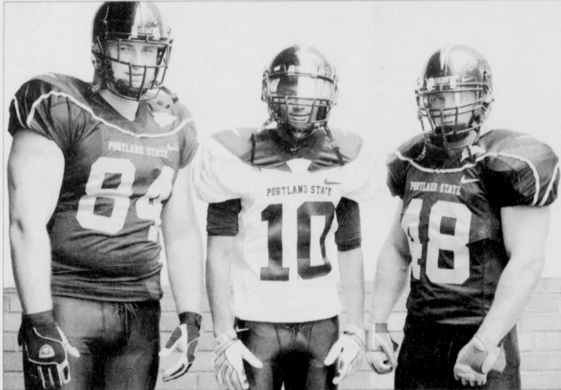
Nike designed black jerseys and helmets to bring a new attitude to the Portland State University football program.