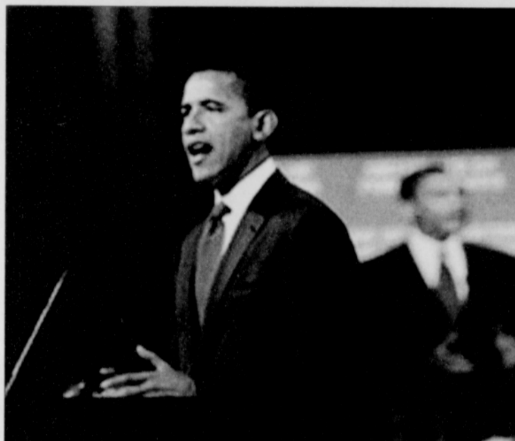
Democratic presidential hopeful, U.S. Sen Barack Obama, D-Ill., addresses the Veterans of Foreign Wars national convention Tuesday in Kansas City, Mo.

In a speech to the Veterans of Foreign Wars in Kansas City, Mo., Obama said top military commanders recognize that there is no military solution in Iraq.