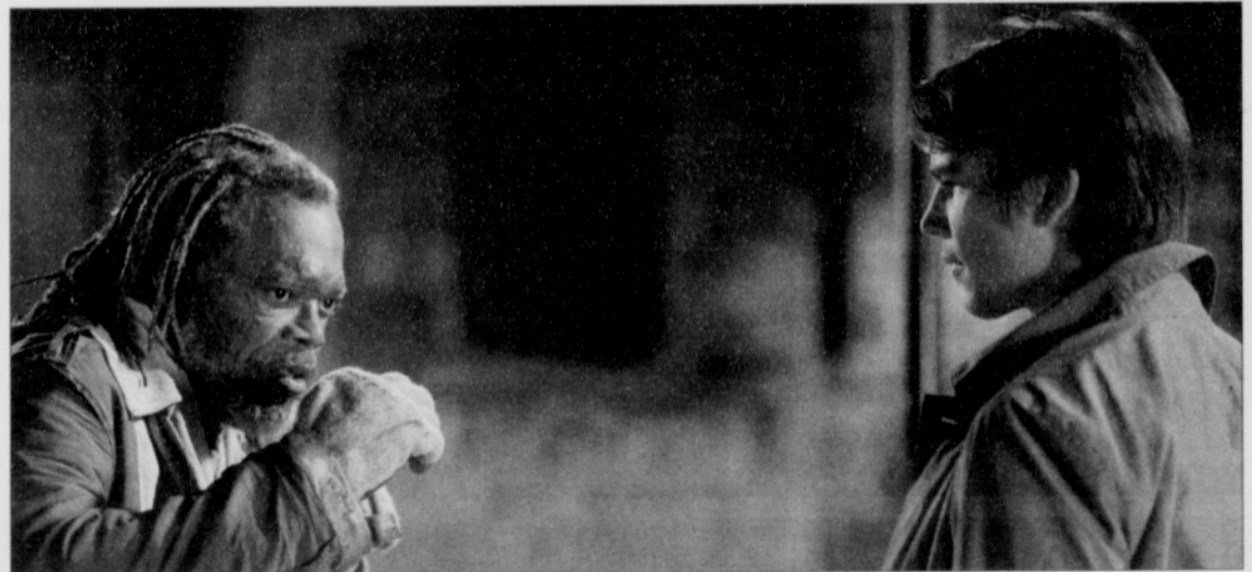
Samuel L. Jackson matches up with Josh Hartnett in Resurrecting the Champ . The explosive drama about scandal, ethics in journalism, family and legacy, is scheduled for release nationwide Friday.