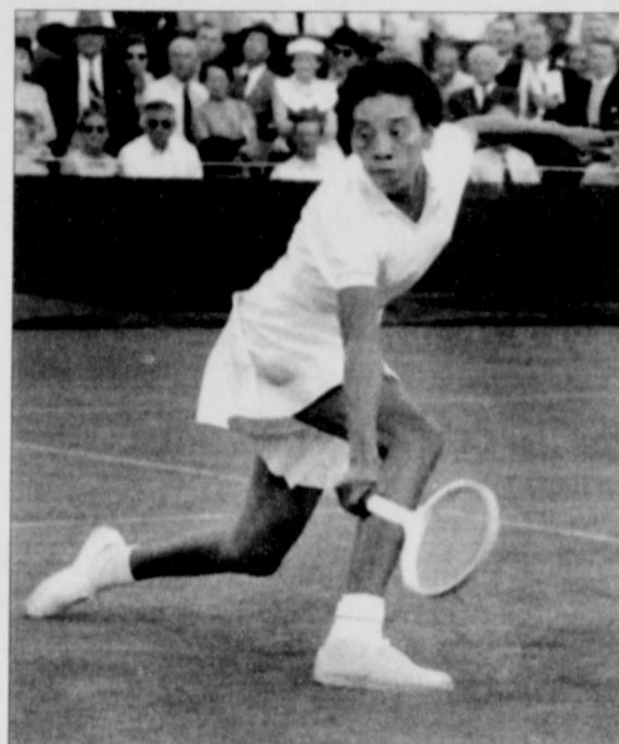
Althea Gibson at Wimbledon in 1956.