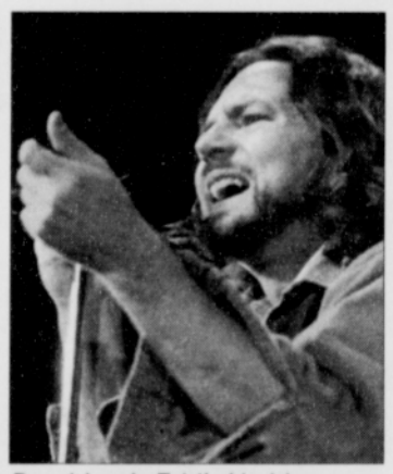
Pearl Jam's Eddie Vedder

Tickets can be purchased at the can also be purchased with service charge at all TicketsWest ticket outlets or by calling TicketsWest at 503-224-8499.