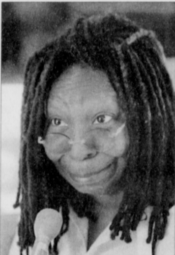
Whoopi Goldberg the day after Labor Day.

That already sets Goldberg apart from her predecessor. "The View," putting Rosie O'Donnell in its rearview mirror, officially introduced Goldberg to the show's audience as its moderator last week. She'll start full time