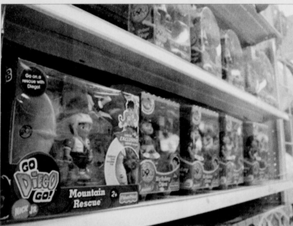
Fisher-Price toys subject to recall include the popular Big Bird, Elmo, Dora and Diego characters, because their paint contains excessive amounts of lead.

Owners of a recalled toy can exchange it for a voucher for another product of the same value. To see pictures of the recalled toys, visit service.mattel.com. For more information, call Mattel's recall hot line at 800-916-4498.