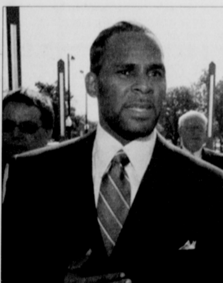
R. Kelly is scheduled to go on trial Sept. 17, more than five years after the R&B singer was first charged with child pornography.

"I'm going through my own struggle... and you're either gonna fold or you're going to stand," Kelly told The Associated Press in 2005, "and I believe in standing."