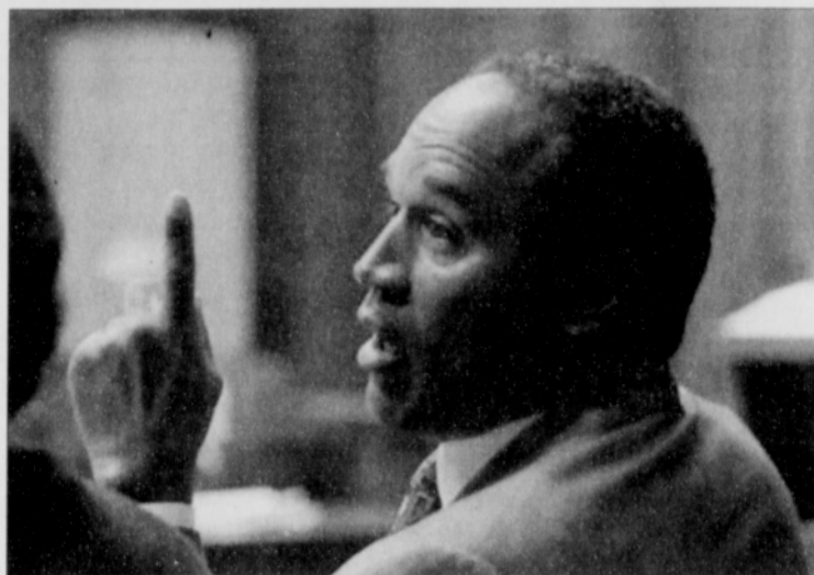
O.J. Simpson talks with one of his defense attorneys during his 2001 'road rage' trial in Miami-Dade County court.

Simpson was acquitted of criminal charges at the end of a sensational murder trial in 1995 but was found liable for the deaths of his