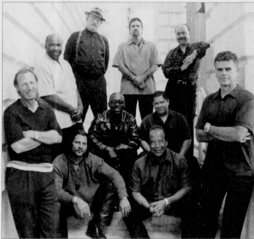
Tower of Power will perform at the Oregon Zoo on Sunday, Aug. 12.

Tickets are $22 and were still available at all Ticketwest outlets.