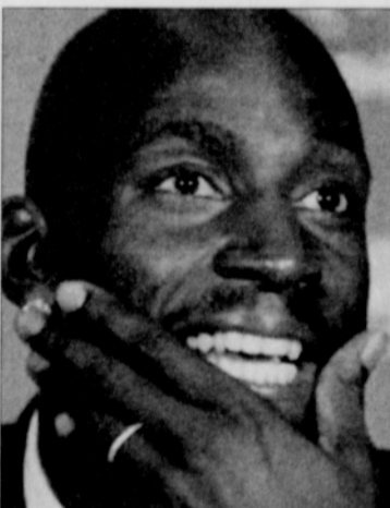
Kevin Garnett smiles at a news conference in Boston.

Garnett, the 2004 league MVP, originally balked at getting traded to Boston, a youthful team that finished with the second-worst record in the NBA last season at 24-58.