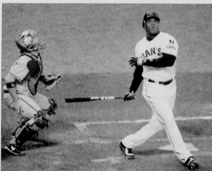
Barry Bonds has tied Hank Aaron's homerun record.

Fans came prepared with gloves, nets and anything else that would