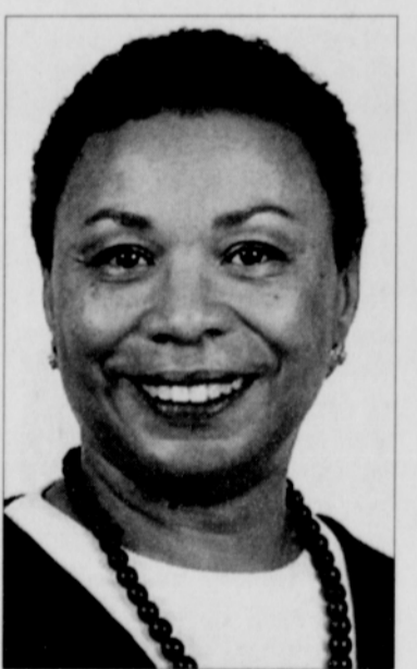
U.S. Rep. Barbara Lee, D-Calif.

By a vote of 399-24, the House passed legislation last week introduced by Congresswoman Barbara Lee, an African American lawmaker from Oakland, Calif., to prevent permanent military bases in Iraq and bar U.S. control over Iraqi oil resources. Lee's bill declares that it is the policy of the United States not to establish any military installation or base for the purpose of providing for the permanent stationing of United States Armed Forces in Iraq and not to exercise United States control of the oil resources of Iraq and prohibits the use of funds for these purposes. "What this legislation does is simple. It does what the Iraq Study Group and other experts have recommended that we do. It makes a clear statement of policy that the U.S. does not intend to maintain an open ended