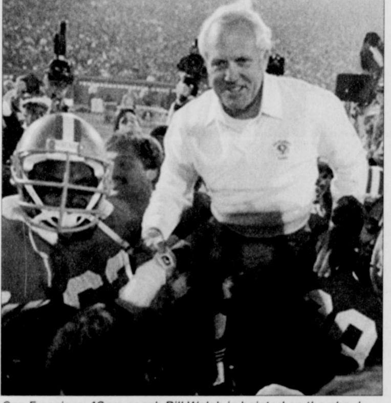
San Francisco 49ers coach Bill Walsh is hoisted on the shoulders of his team after they defeated the Miami Dolphins 38-16 in Super Bowl XIX, Jan. 20, 1985.

The soft-spoken native Californian also produced a legion of coaching disciples that's still growing today.