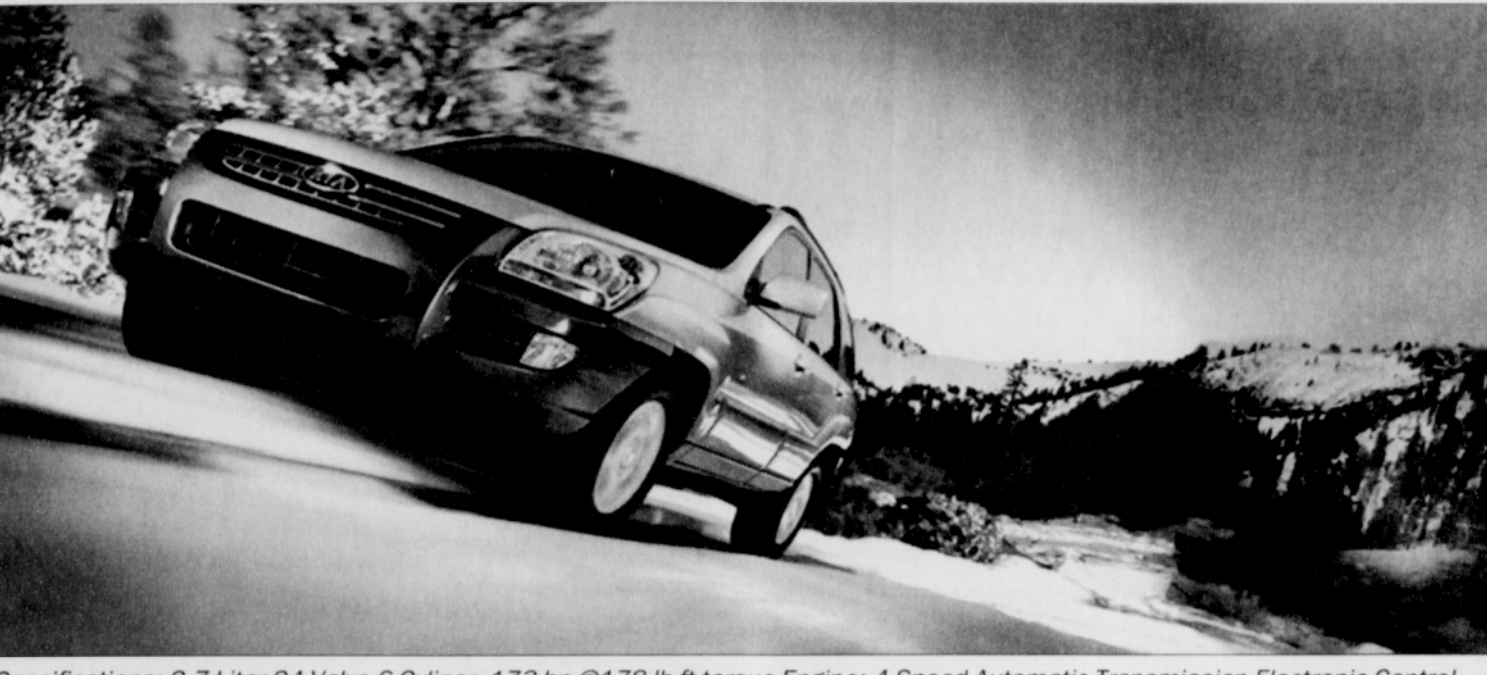
Specifications: 2.7-Liter 24-Valve 6-Cyliner, 173 hp @178 lb-ft torque Engine; 4-Speed Automatic Transmission Electronic Control On-Demand 4-Wheel Drive; 19-City 23-Highway MPG; $22,775 MSRP

powerful V6 engine is available, tronically controlled with a pushmated to a four-speed Sportmatic TM transmission. The lightweight, designed for all-weather, all-seacompact, DOHC 24-valve all-alumi- son traction and primarily offered