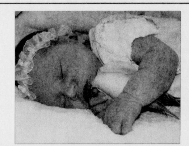
Rachael Sperry & Adam Huyhn proudly announce the birth of Emele Faye Huyhn on July 23, 2007; 5-lb 12-oz, 17.5-inches

With every option available, the Sportage's price is still well under $24,000. It's a price point that should give the new Sportage best-value consideration in the small SUV market. Like all Kia models, the Sportage is covered by a comprehensive warranty program, which offers unprecedented consumer protection. Included in the package are a 10year or 100,000-mile limited powertrain warranty; a five-year or 60,000-mile limited basic warranty; and a five-year or 100,000mile anti-perforation warranty. A five-year/60,000-mile roadside assistance plan is also part of the comprehensive coverage program. If you're on a modest budget but don't want to give up comfort or convenience, the 2007 Kia Sportage is definitely worth