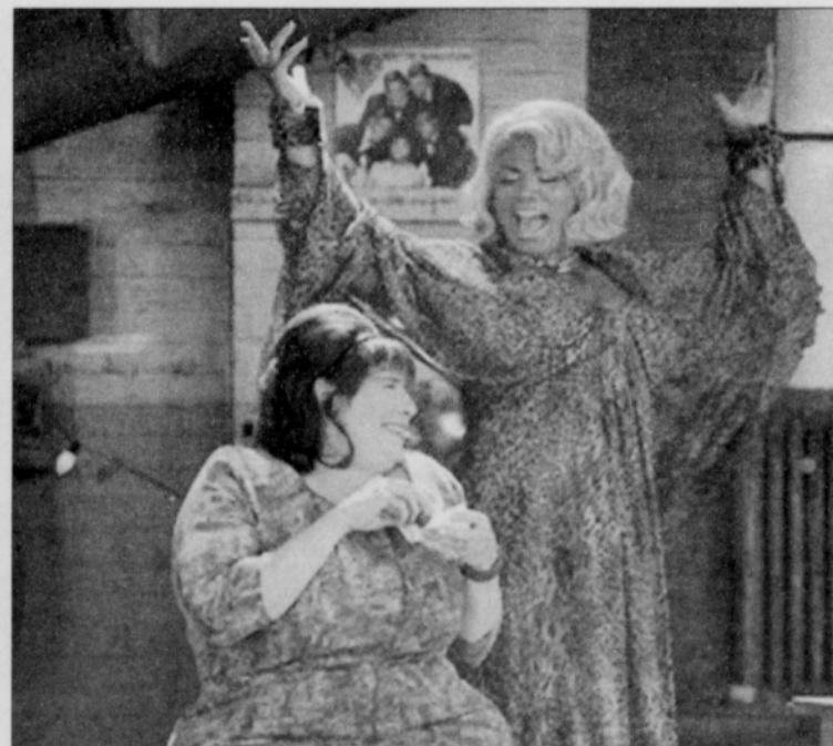
Queen Latifah (standing) plays Motormouth Maybelle alongside John Travolta in drag, in the remake of the 1988 film "Hairspray."