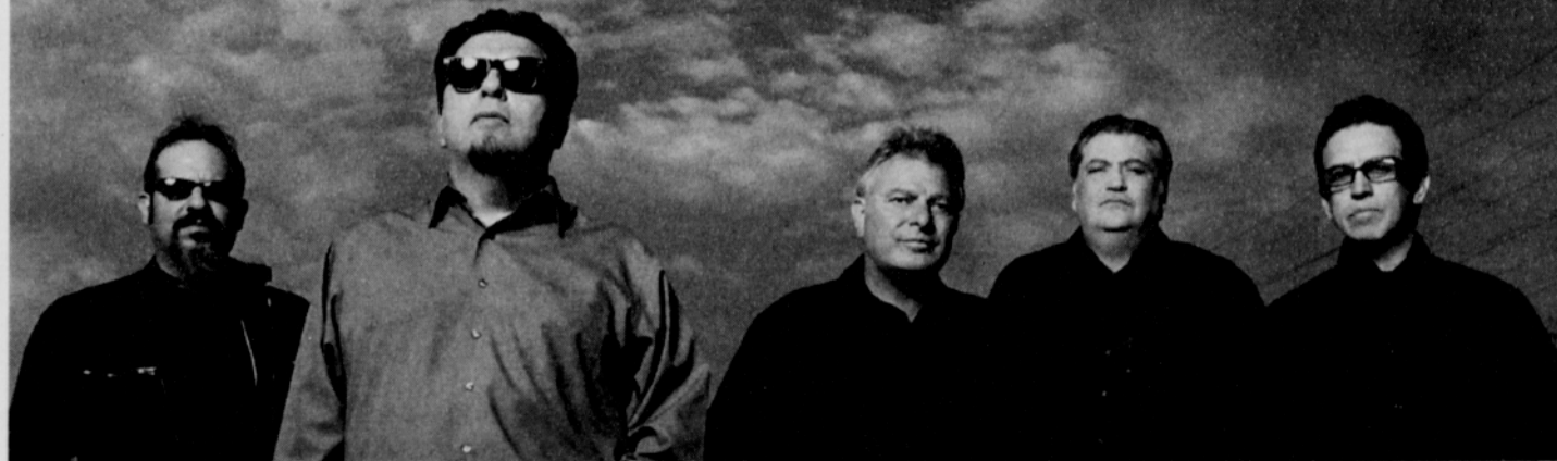
Los Lobos translates to "the Wolves," which is appropriate for their Wednesday, July 25 appearance at the Oregon Zoo.