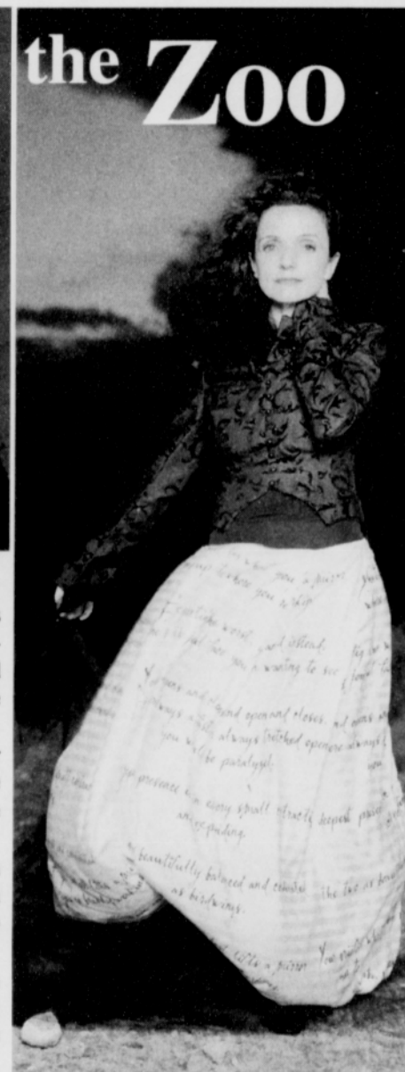
The Oregon Zoo presents Patty Griffin on Friday, July 20.

For more information on both shows visit www.oregonzoo.org or call 503-226-1561.