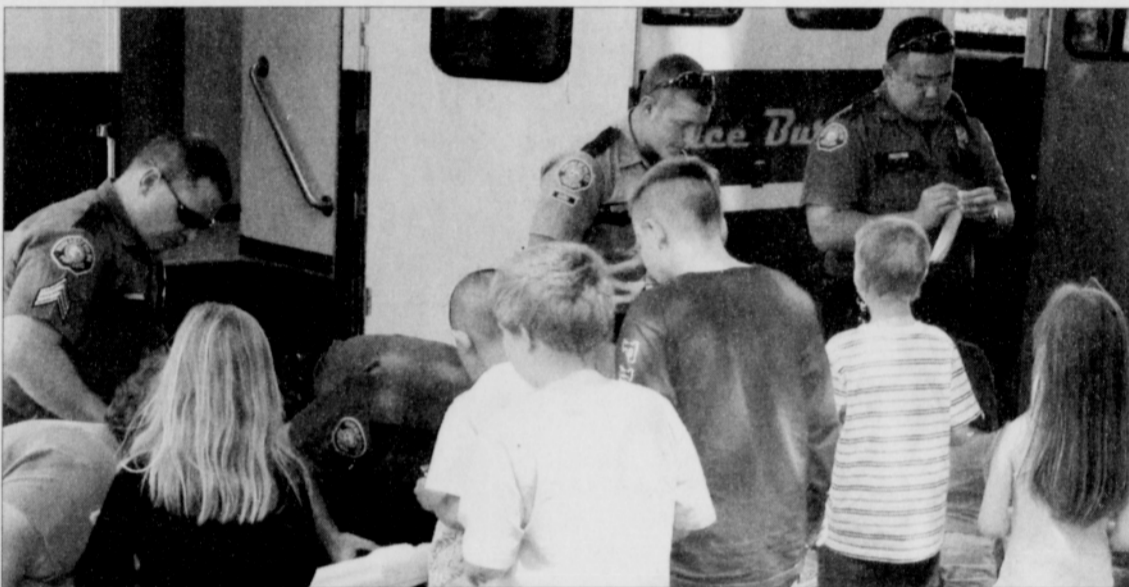
Portland Police Bureau officers hand out ice cream and popsicles.