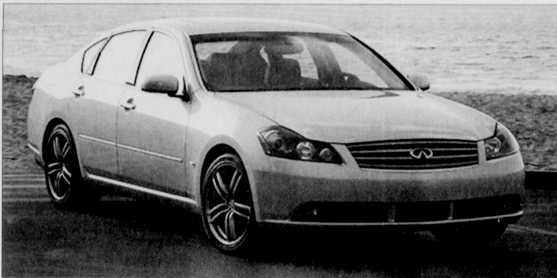
Specifications: 3.5-Liter 24-Valve 6-Cylinder 275-hp @ 268 lb-ft torque engine; 5-Speed Auto Transmission w/Manual Shift Mode & Downshift Rev Matching; Intelligent All-wheel Drive System w/ Snow mode; 17-City 24-Highway MPG; $54,900 MSRP

Standard safety features on the M35 are antilock disc brakes (with brake assist), stability control, front-seat side airbags, full-length side curtain airbags and active head restraints for the front seats, tire pressure monitoring system w/location display and a first aid kit. One of the coolest safety features is the lane departure warn-