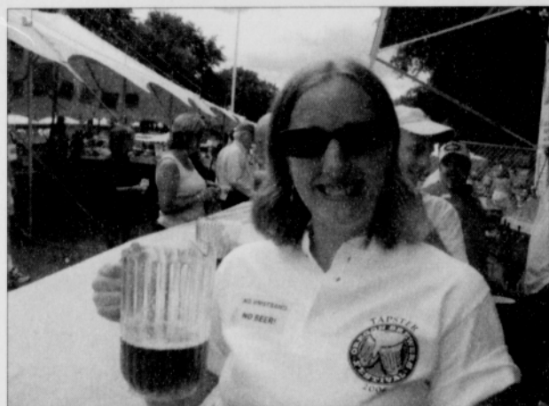
Oregon Brewer's Festival

ous situation of indigenous women in Mexico. "Mujeres indigenas de Mexico is on display through July 24 at Onda Arte Latina/Cross Currents Gallery, 2215 N.E. Alberta St.