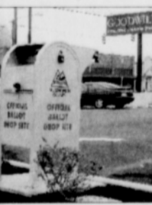
An official ballot drop site at Benson High School in Portland. Ballots in the November General Election will be mailed to voters on Friday.