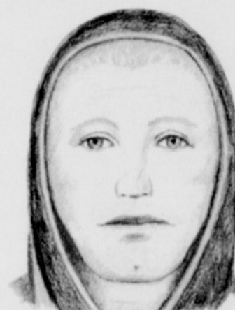
A police sketch of a person of interest in the Alberta Street arsons investigation.

The most significant fire involved an occupied apartment complex at 5026 N.E. 31st Ave. where occupants had to flee for safety.