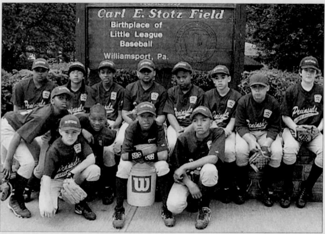
The Enterprise baseball team from north and northeast Portland's Peninsula Little League pose for a team photo in Williamsburg, Pa., home of the Little League World Series.

The jamboree featured 13 other teams from across the nation, including teams from Akron, Ohio,