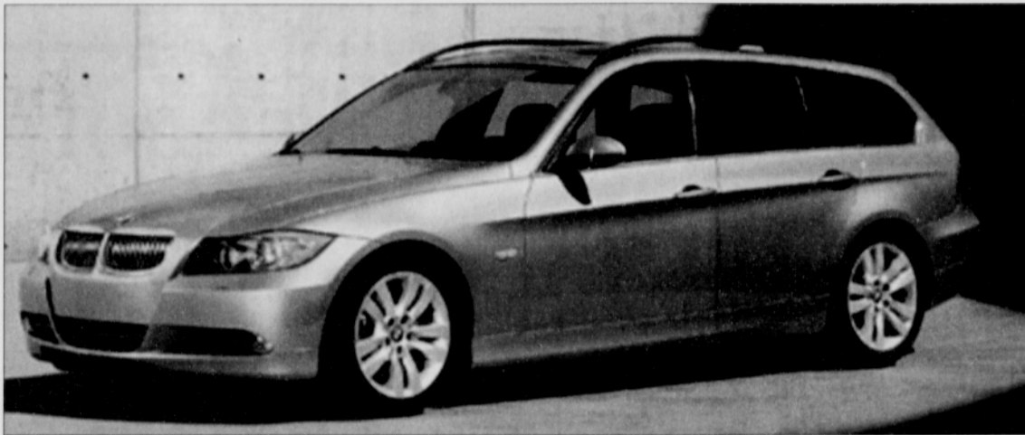
Specifications: 3.0 liter dual overhead cam (DOHC), 24-valve in line 230 horsepower 6-cylinder engine; 6-speed automatic overdrive transmission; 19 city mpg, 28 highway mpg, $34,200 MSRP

This BMW 3 Series are the largest cars in the 3 series ever. They're more than two inches longer and three inches wider, and wheelbase has increased 1.4 inches. Most of