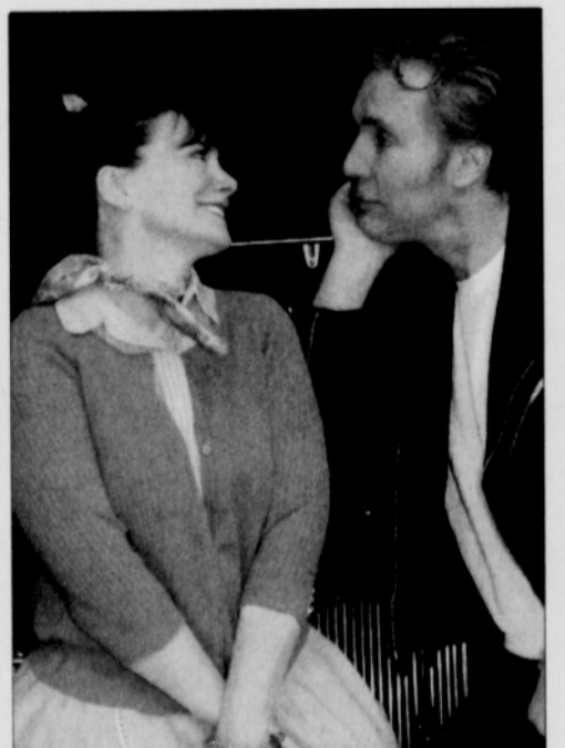
Grease, The Reunion

Comedy Open Mic Night -- Mt. Tabor Legacy is having comedy open mic on Sunday, June 3. Stage time is free and you get 10 minutes to show how funny you are. Contact MtTaborLegacy@gmail.com if you are interested.