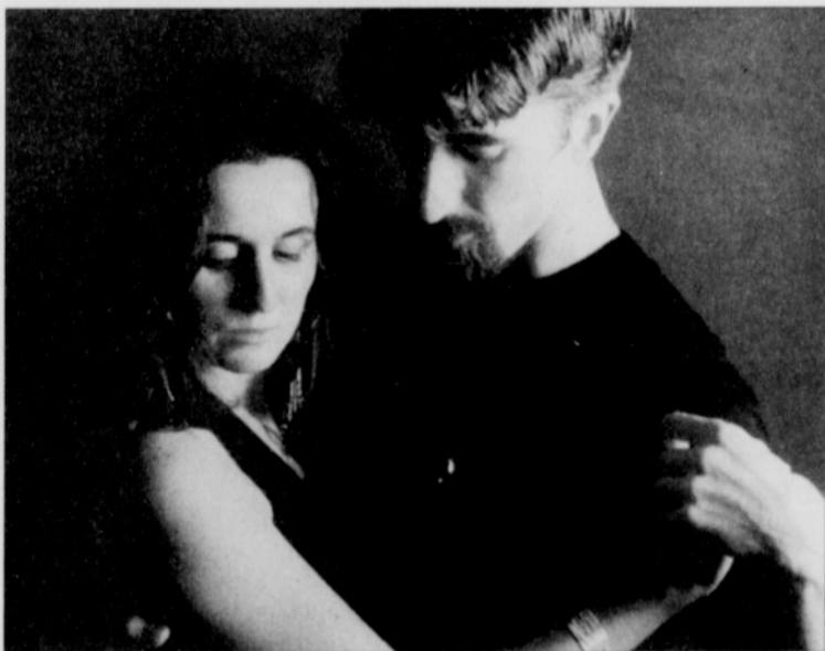
Latin Dance Masters

'Hurricane on the Bayou' -- OMSI takes the audience deep into the soul-stirring heart of Louisiana with "Hurricane on the Bayou," now playing at