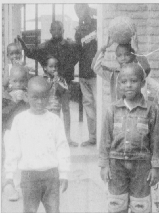
Orphan children of Rwanda are pictured during a visit to the East African country by Portland's hip hop group Hungry Mob.

Global Family Network is committed to supporting their work. This commitment stems from a 2004 con-