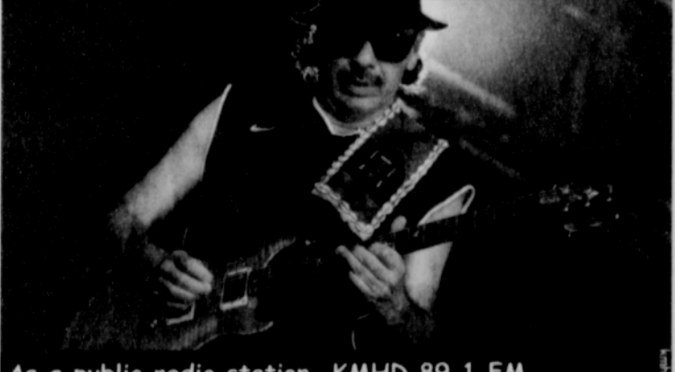
As a public radio station, KMHD 89.1 FM strives to maintain genuine open and non-bureaucratic access for the listening public.

"If our history can challenge the next wave of musicians to keep moving and changing, to keep spiritually hungry and horny, that's what it's all about." Carlos Santana