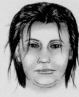
(Witness Description) Heavy Set White/Hispanic Female Approximate age: 28-30

Possibly traveling in a two-door black Ford Explorer; with a male companion, whom the F.B.I. believes to be armed and dangerous. CAUTION ADVISED