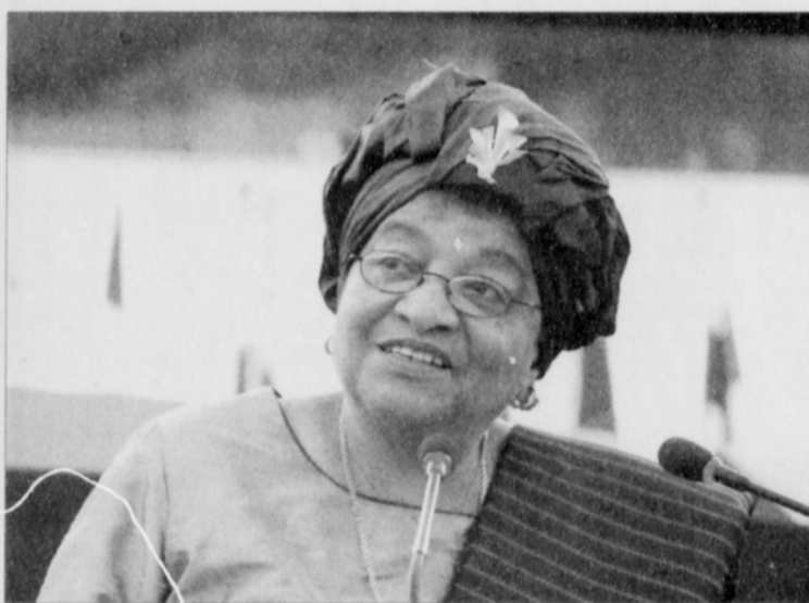
Ellen Johnson Sirleaf