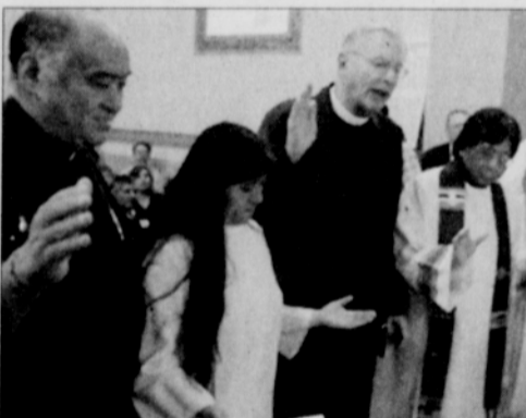
Anglican ministers in Los Angeles bless the family of an immigrant facing deportation during a ceremony declaring Our Lady Queen of Angels Catholic Church a sanctuary from immigration authorities.

ICE spokeswoman Virginia Kice declined to say whether agents would attempt to arrest others who take sanctuary in churches.