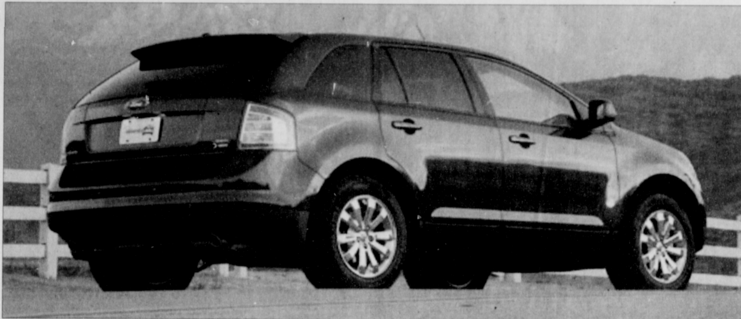
2007 Ford Edge-Sel Plus AWD: 3.5-Liter, 256-hp DOHC V6 Engine; 6-Speed Automatic Transmission; 17-City 24-Highway MPG; $36,580 MSRP

The Edge comes from Ford's freshest new car, Fusion, but it adds lots of content and functionality. Most importantly is the all-new 3.5-liter V6, a high tech, high content, aluminum engine with 265-hp and 250 lb-ft of torque. Ford has done