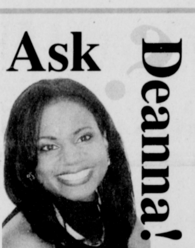
Real People, Real Advice An advice column known for its fearless approach to reality based subjects!

your girlfriend with a few visits from a cleaning service and hope this cramps your style, surprise moving.