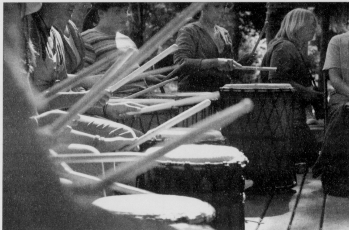
Drumming brings the arts alive for local youth.