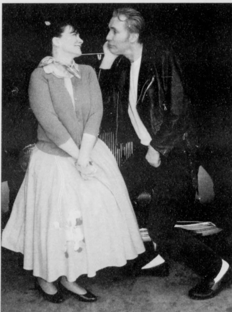
Grease, The Reunion

Tibetan Peoples and Landscapes -- Tuesday, May 8, at 7 p.m., the Portland Art Museum, 1219 S.W. Park Ave., presents an introduction and overview of the world of Tibet through photographs. Visit portlandartmuseum.org or call 503-226-0973 for tickets.